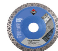
TVR SUPERPRO 125mm | Ref.30987