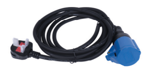
Cable for UK Ref. 58853