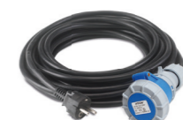
Cable for EU Ref. 58850